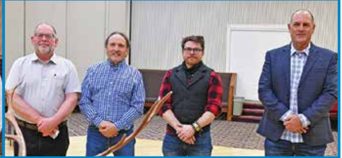
March 19, 2026