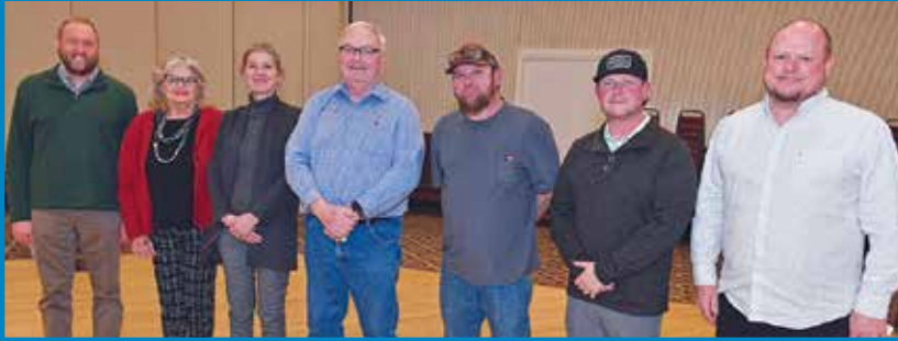
February 19, 2026