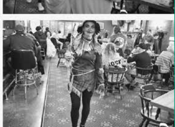
Mocktail Taste Test and Charcuterie Boards Public Event by Heartview Foundation and Bismarck-Mandan Elks Lodge 1199.