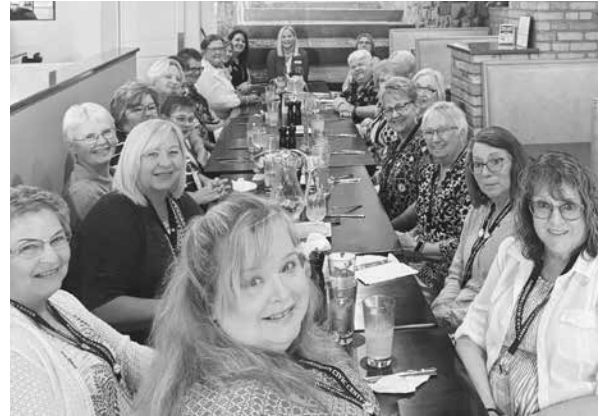
2024 Ladies Luncheon at the State Convention in Jamestown.