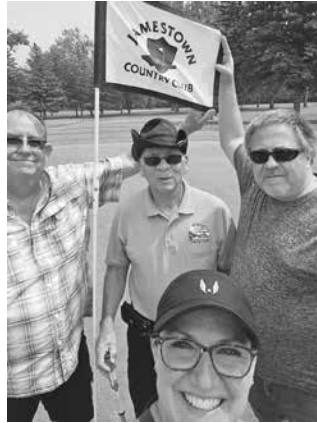
2024 convention golf tournament. Last place winners.