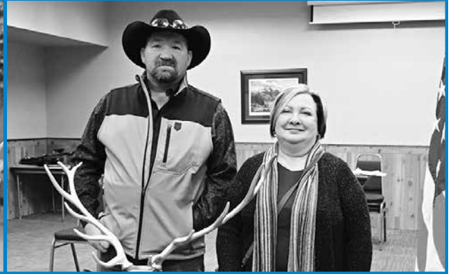
March 21, 2024