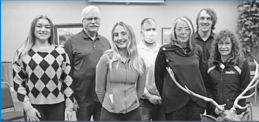
February 15, 2024