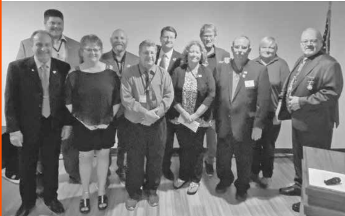
Congratulations to the New State Officers, 2021