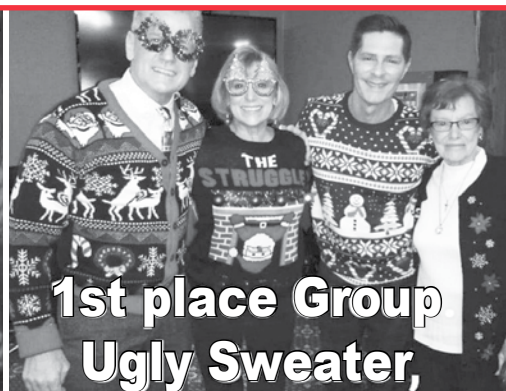
1st place Group Ugly Sweater,