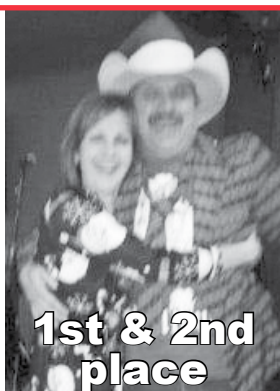
1st & 2nd place